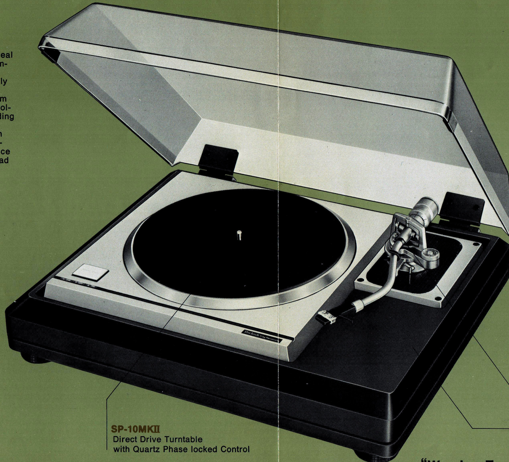
SP-10MKII Direct Drive Turntable with Quartz Phase locked Control